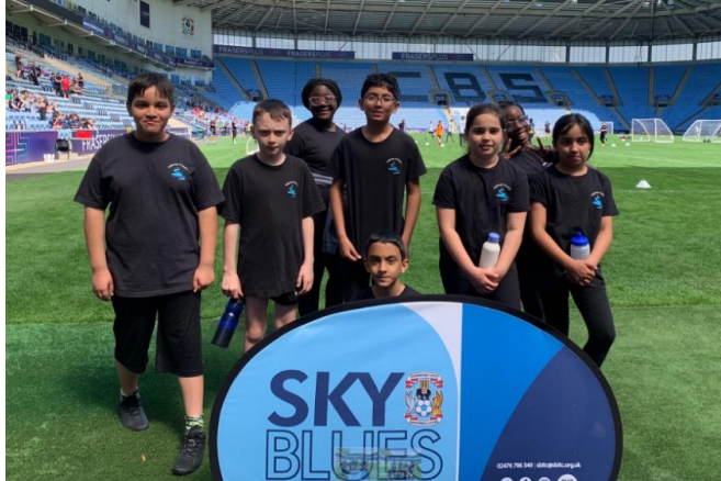
Sky Blues in the Community – Matches at the CBS Arena.

The Hado competition targeted pupils who would not normally represent the school in sport! Combining technology as well as movement it was very engaging for all and pupils greatly enjoyed taking part.