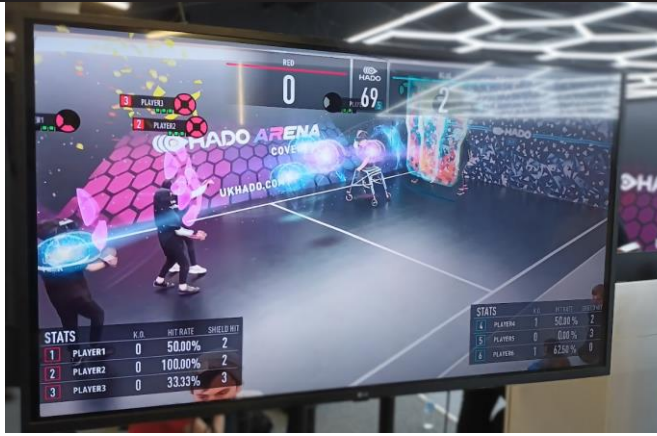
Hado! – An agmented reality sport!